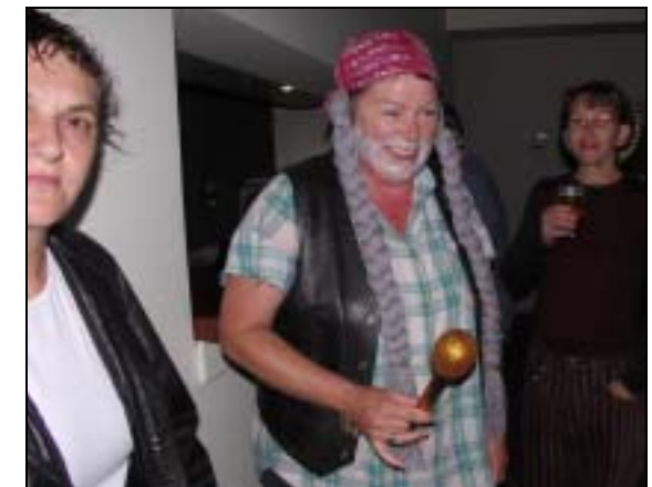
Shock guest appearance by Willie Nelson, "waddya mean it's women only?"

Next Women's Dance in July, stay tuned for details