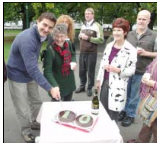
Now we are ten, (for those wondering, it was a chocolate mud cake, yum!)

the Salamanca Market arrests in 1988, Pride marches, the kiss-in, the day of the United Nations decision, the evening of May 1 st 1997 when the Legislative Council finally passed the legislation and we drank a toast on the steps, and the party at Kaos after that. Photos of people, the faces of the campaign. I see how many lesbians were involved in what was superficially a struggle for the rights of gay men and how many heterosexual people were committed to repealing laws that only indirectly affected them. I see people from other movements – women's and men's liberation, Aboriginal rights, conservation, international human rights, mental health – who took time out from their own campaigns to join with us to make something right.