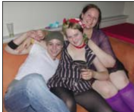
Some swooning party grrls.

Next Women's Dance in July, stay tuned for details