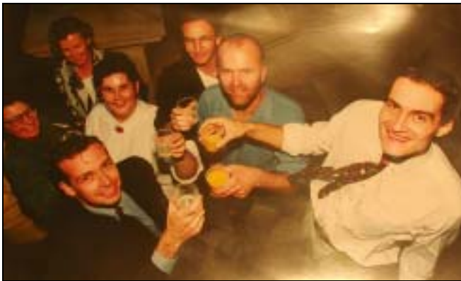
10 years ago. 9 years for one fight. Lifetimes committed to change. We never stop coming out. We never stop.

So Happy Gay Law Reform and I invite you to join with me in reflecting, in taking a look at our lives right now, and in shaping our shared future together.