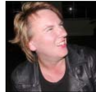
Just one of Miasma's many fans