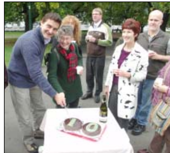
Now we are ten, (for those wondering, it was a chocolate mud cake, yum!)

the Salamanca Market arrests in 1988, Pride marches, the kiss-in, the day of the United Nations decision, the evening of May 1 st 1997 when the Legislative Council finally passed the legislation and we drank a toast on the steps, and the party at Kaos after that. Photos of people, the faces of the campaign. I see how many lesbians were involved in what was superficially a struggle for the rights of gay men and how many heterosexual people were committed to repealing laws that only indirectly affected them. I see people from other movements – women's and men's liberation, Aboriginal rights, conservation, international human rights, mental health – who took time out from their own campaigns to join with us to make something right.