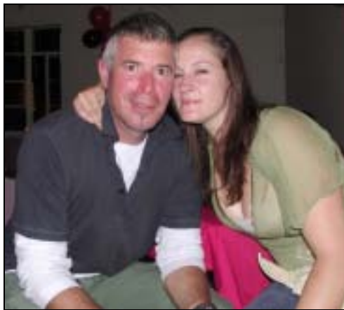
Some questioning soul mates