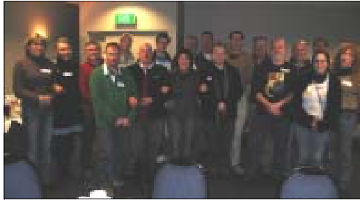
Community representatives from all over the state attended the DPAC meeting

From this meeting, further refinement of the consultative process can be explored.